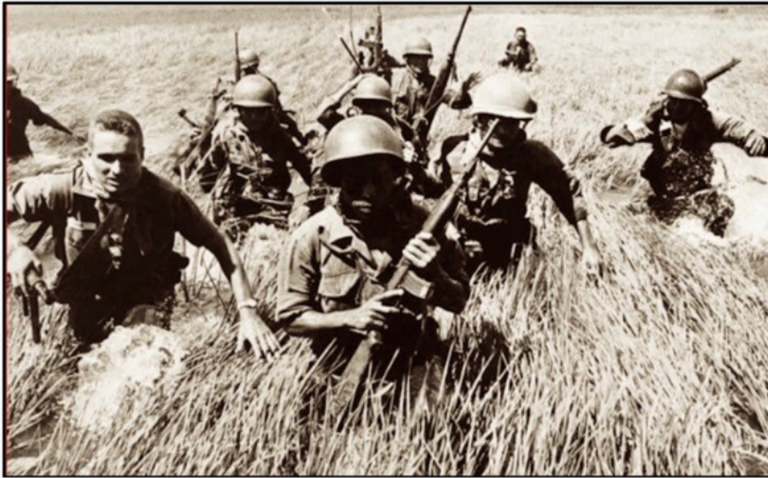
EXHIBIT OPENING NOVEMBER 12

Over 30 local Vietnam Era Veterans have been interviewed for this extensive exhibit commemorating the 50 th anniversary of the conflict. The exhibit includes a book with each veteran's story included.