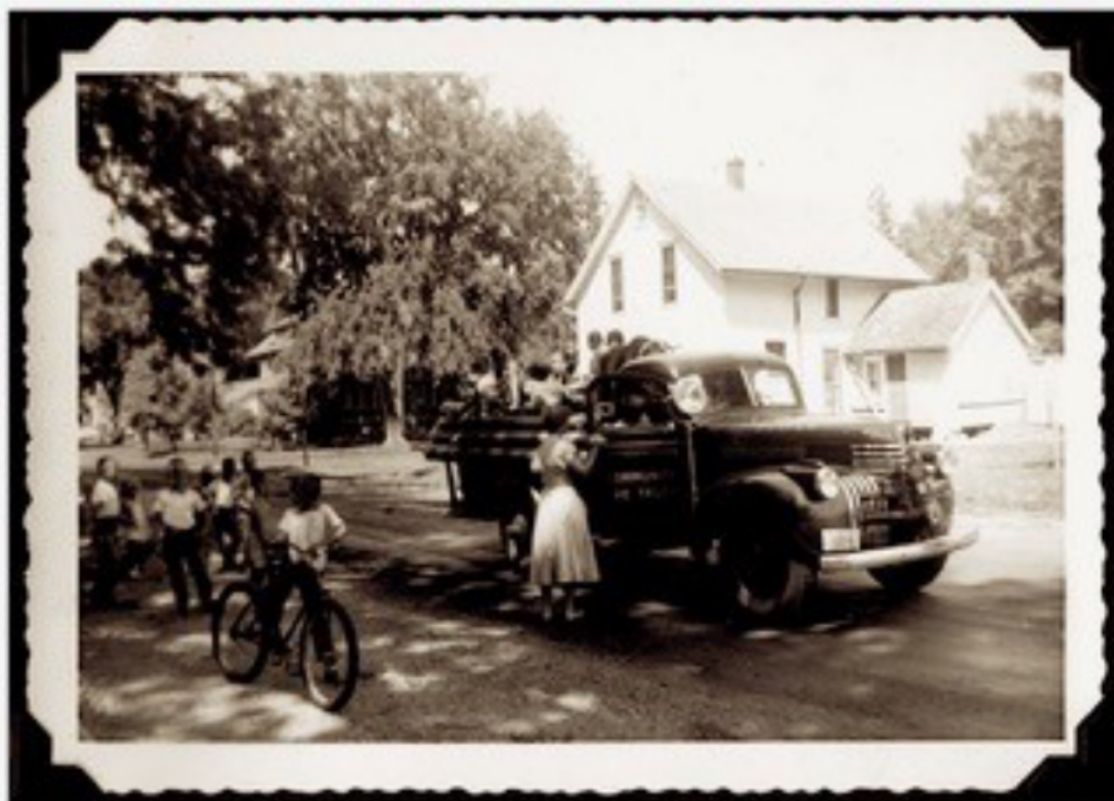
A ride on the fire truck 1955

Be sure to visit Heritage Hall Museum to view Growing Up in A Small Town , our latest exhibit. It's a snapshot of what life was like during the era of Leave It to Beaver and Father Knows Best . The exhibit is full of stories about being a kid in the 1950's and 60's. Did you know that during the summer the kids would wait for someone to pass away because the undertaker threw out the coffin's huge carton and they played in it all summer?!